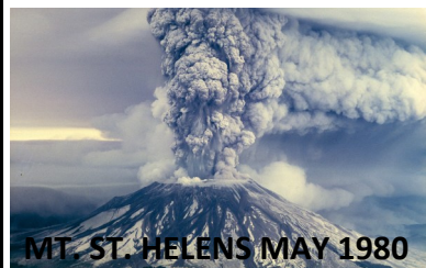
MT. ST. HELENS MAY 1980

When the enemy strikes and I fail, God is there for me as He was for David. I will walk through life's challenges and joys and when life as I know it here ends, I will stand forgiven in God's presence. Where will you be? I know that Jesus died for my sins. I believe Jesus is who He said He was, the very Son of God. I've accepted His Word. I've known the joy of God's discipline and forgiveness for a lifetime. I understand the "peace that passes all understanding." He died for the sinfulness of all mankind out of a love that surpasses anything I could imagine. He died for you. My deepest desire is to see you there too.