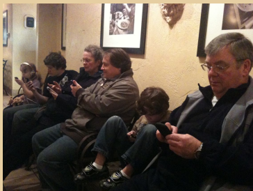
Family Togetherness 2010

THANK YOU SO MUCH FOR YOUR FAITHFUL ENCOURAGEMENT AND FINANCIAL SUPPORT!