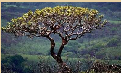
fig tree may not blossom (and stocks fall in value), nor fruit be on the vines (and our savings are depleted); though the labor of the olive may fail, (and 401K accounts diminish) and the fields yield no food (and my food budget is gone); though the flock may be cut off from the fold (and my gas tank is empty), and there be no herd in the stalls (and my utility bills keep increasing) --Yet I will rejoice in the LORD, I will joy in the God of my salvation. The LORD God is my strength; he will make my feet like deer's feet, and He will make me walk on my high hills . . ." (NKJ)

The Old Testament prophet Habakkuk shared these thoughts for us today: Habakkuk 3:17-19 "Though the