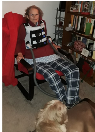
One of her many treatments just to breath

I am reminded that ultimate healing and the end of suffering, sadness, sorrow, sickness and separation is in His presence. He will wipe away every tear (Revelation 21:4). But for now, the tears flow. Even Jesus wept at the tomb of his friend Lazarus. In John Bunyan's Pilgrim's Progress , the character Evangelist said to Christian, "Sometime we see clearest through our tears." I am trusting that to be true.