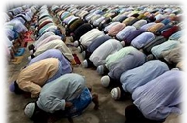
THEY PRAY BECAUSE IT'S REQUIRED.