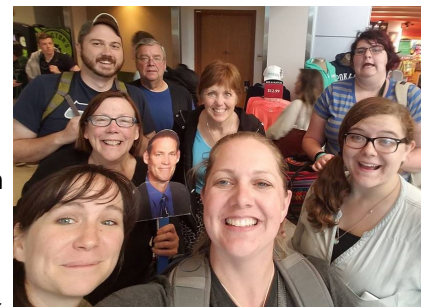
WE MADE IT BACK TO SPOKANE ALIVE, MOSTLY