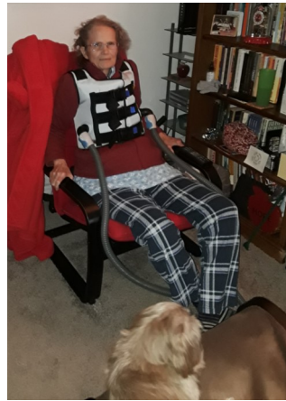
One of her many treatments just to breath

I am reminded that ultimate healing and the end of suffering, sadness, sorrow, sickness and separation is in His presence. He will wipe away every tear (Revelation 21:4). But for now, the tears flow. Even Jesus wept at the tomb of his friend Lazarus. In John Bunyan's Pilgrim's Progress , the character Evangelist said to Christian, "Sometime we see clearest through our tears." I am trusting that to be true.